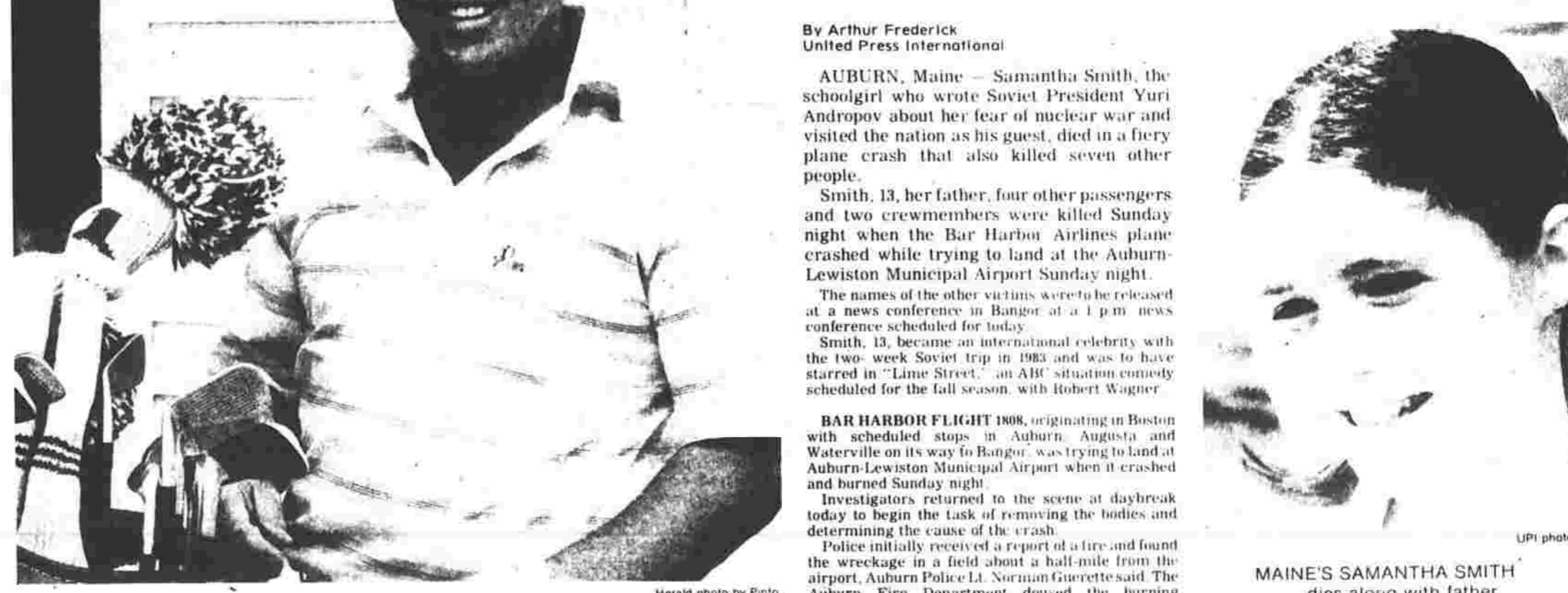
MANINE'S SAMANTHA SMITH dies along with father